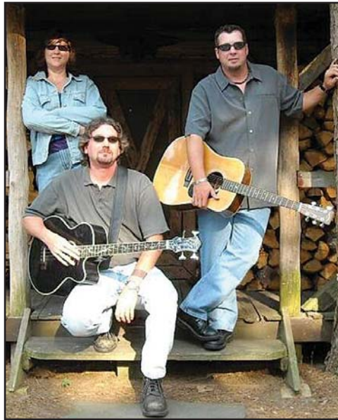
“Take Two Plus One,” one of the rock groups performing at the Festival.

“ Take Two Plus One ,” originally known as “Take Two,” a brother-sister duo, changed its name when a third musician was added. Today the